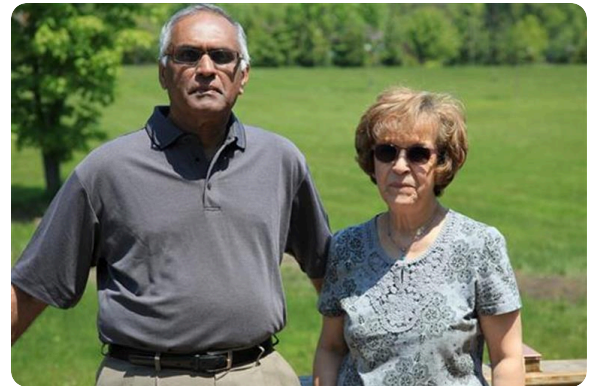
Visiting us in Grafton, Ontario; 2011