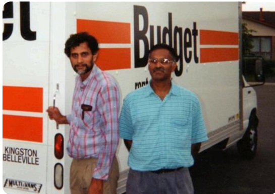
Helping us move in 1994